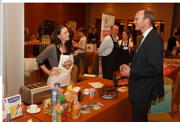
Left: Minister Coveney at the South East Food Showcase

attempting to focus the remaining available resources in favour of investment opportunities in the Food Harvest 2020 strategy and the Government's Programme for Recovery.