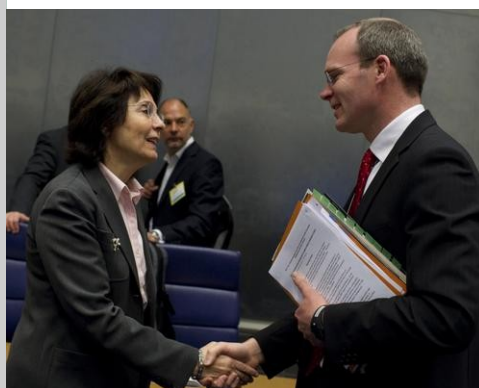
Minister Coveney with Maria Damanaki, European Commissioner on Maritime Affairs and Fisheries

European Commissioner on Maritime Affairs and Fisher-