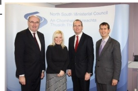
Minister Coveney & Minister Hogan with Michelle O'Neill, Minister for Agriculture & Rural Development; Edwin Poots, Minister of the Department of Health, Social Services and Public Safety

On 26 October I hosted the NSMC Agriculture sectoral meeting . I met with the Northern Ireland Minister for Agriculture and Rural Development, Michelle O'Neill who was accompanied by Minister Edwin Poots. We discussed the development of the all island animal health and welfare strategy. The recent developments on the Common Agriculture Policy were also discussed.