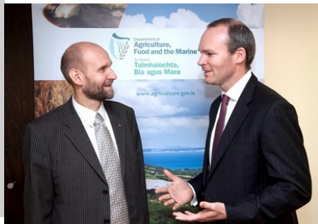
Minister Coveney with the Estonian Agriculture Minister Helir - Valdor Seeder

I have met with the Estonian Agriculture Minister, Helir - Valdor Seeder, and have meetings lined up with my Finnish and UK Ministerial colleagues before the end of the year. Negotiations will be taking place at political and technical level over the next year or more. As negotiations develop, I will continue to interact with my Ministerial colleagues and with the Commission and European Parliament. My intention is to maintain and develop alliances with like-minded Member States to secure the best possible outcome for Ireland.