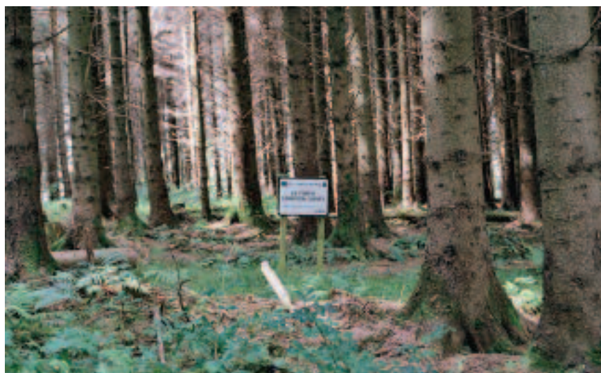
Forest monitoring site at Dromahaire, Co Leitrim.

Ireland has made a commitment at Ministerial level, along with other Member States and signatory nations, to supply annual forest data from the Irish forest