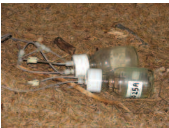
Deep soil water samplers.

Air quality: The FutMon project also records other aspects of air quality at the FutMon Level II plots on a monthly basis. Measures of nitrogen in the form of ammonium and nitrogen dioxide are recorded, as is sulphur dioxide. Amounts of ozone in the air are also measured at the FutMon plots as ozone at ground level is known to be potentially damaging to both plant and human health. In addition, an assessment of vegetation is conducted to examine plants for signs and symptoms characteristic of ozone damage.