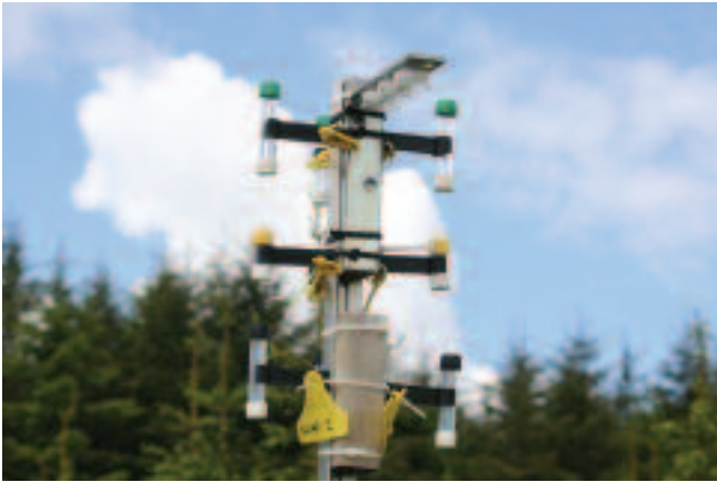
Ambient air quality passive samplers.

Meteorology: Automated weather stations located at the three FutMon Level II plots collect detailed information on rainfall, air temperature, relative humidity, wind speed and direction, and solar radiation. These records are used in conjunction with other surveys, for example phenology to measure the length of the tree growing season in Ireland and also to serve as a permanent record of climate data for Irish forests. The data may also be used to validate climate change models for Ireland.