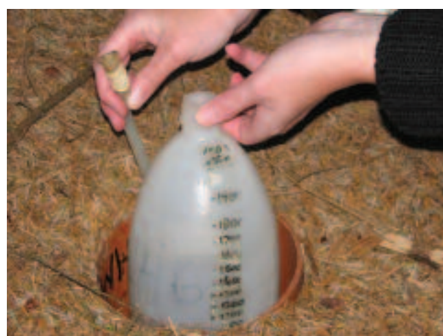
Humus soil water sample collector.