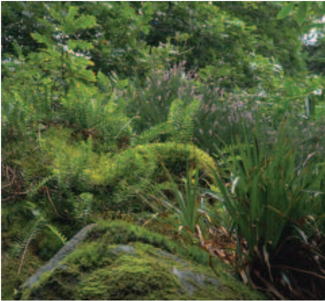
Diverse ground flora at Brackloon - an intensively monitored plot in Co Mayo.

Leaf area index: Leaf area index (LAI) is a new survey to the FutMon project in Ireland. LAI represents the amount of leaf/needle material in an ecosystem relative to ground area. Monitoring changes of LAI is important for assessing growth and vigour of trees. The amount of leaf material on trees has an effect on fundamental processes such as photosynthesis, respiration, transpiration and rain interception. Measurements are recorded annually using hemi-spherical photography to give a pictorial record of tree crown structure. These photographs can be digitally evaluated and used to reconcile with the data collected under the FutMon crown condition survey. Changes in tree crown structure again provide an early warning of processes occurring within the forest ecosystem.