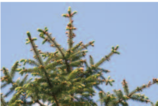
Key phenological bud flushing stage in Sitka spruce.

Phenology: Phenology is a measure of key seasonal tree growth phases in the forest. The occurrence of major growth events such as bud burst and flowering in the forest canopy along with leaf fall in deciduous trees are recorded at the FutMon level II plots. Long term records give an indication of changes in length of the growing season in Ireland in response to predictions of climate change. How trees and forest ecosystems may react to such changes is unclear, but this kind of data may be used to validate growth and climate models.