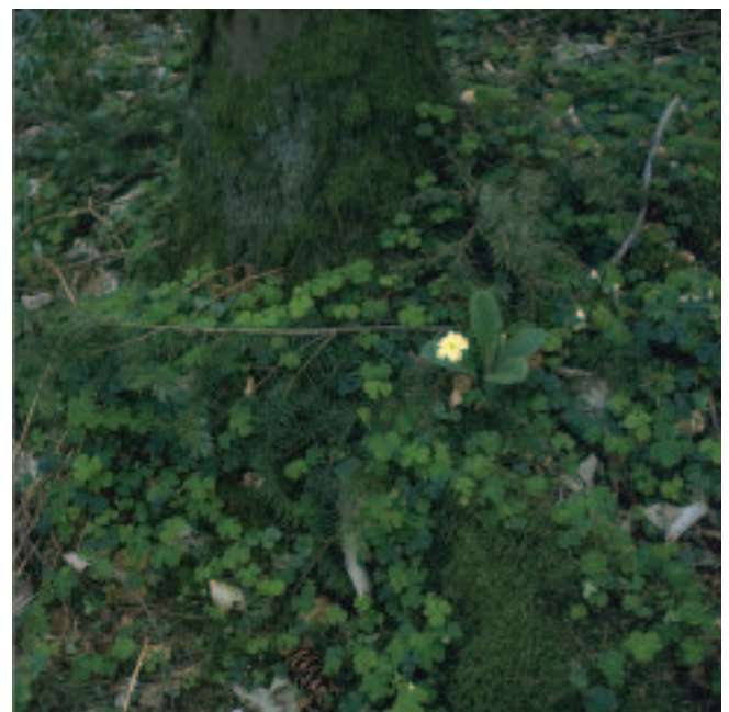
Typical woodland flora.

Biodiversity: Forests are considered to be the richest terrestrial ecosystems for biodiversity. In Ireland and across Europe, forests provide food, shelter and a habitat for many species of plants, animals and fungi. Recently, the European Commission and the Member States have become increasingly concerned about the loss of biodiversity in Europe and 2010 has been labelled as the International Year of Biodiversity. In addition, Ireland is a signatory nation to the Convention on Biological Diversity, an international treaty to sustain the diversity of life on earth. The FutMon project, through the international network of forest monitoring plots both at Level I and Level II, provides an ideal framework for harmonised assessments of European forest biodiversity to build on successful earlier initiatives such as the BioSoil [1] .