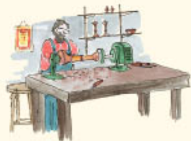
Yew is a prized timber amongst wood turners