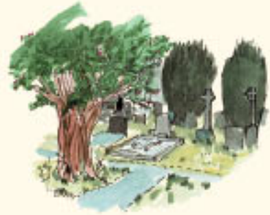
Yew is commonly found in graveyards

Yew is not planted commercially in Irish forestry. However, Irish foresters and other scientists are exploring methods of growing yew for the production of Taxol. Yew is a common species found in many native Irish woodlands. However, it is more frequently seen as a planted tree, as opposed to a naturally seeded tree, in urban or suburban settings. The remains of some impressive estate avenues of yew can still be seen, for example at Kilmacurra, Co. Wicklow. Yews have been associated with places of sanctuary in Irish history and are commonly found planted in church yards. Newry and Youghal are anglicised versions of its Irish name, lúr. Similarly, Terenure in Dublin is the anglicised version of Tír an lúr, the country of the yew. Yew was highly placed in the Celtic classification of trees and shrubs.