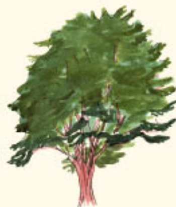
Mature, free standing yew

The bark of the yew tree contains Taxol, a very powerful anti cancer drug. Taxol has been demonstrated in trials to be effective against ovarian, skin, breast and colon cancer. Because of its complex structure, chemical synthesis of Taxol is currently not possible and the only source of this material is the bark of the yew tree. The fresh leaves and bark of the yew tree are a popular food for many different herbivores. Similarly, the yew berry is an important food source for many species of birds and wood mice in particular. As one of Ireland's only two native conifers and because of its extraordinary longevity, yew has a very high heritage value.