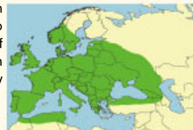
Natural distribution of yew

The yew is one of only two conifers that are native to Ireland, the other being juniper. The species has a natural range from southern Scandinavia to the Mediterranean and from Ireland to the Ural mountains. It is a very variable species with lots of different provenances and clones displaying different growth characteristics and shape. The seed for virtually all yew planted in Ireland is collected locally.