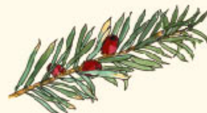
Yew sprig showing berries